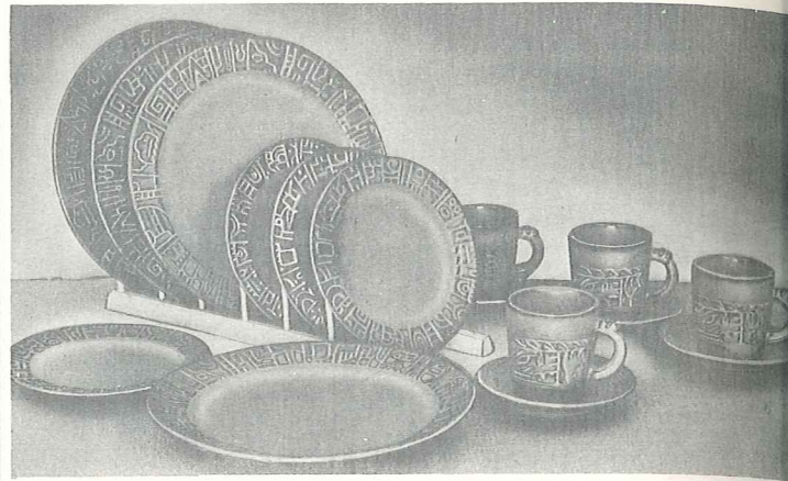
7SS—16 PC. STARTER SET, BOXED—15.00