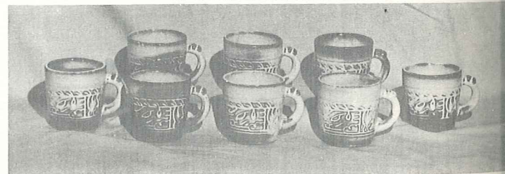
7CC—SET OF 8 COFFEE CUPS, BOXED—6.50