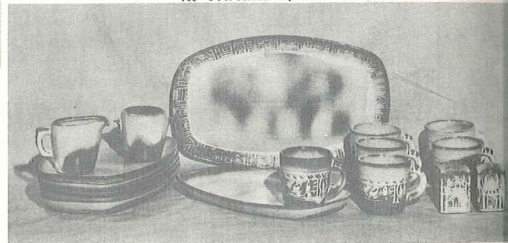
7BB—17 PC. BARBEQUE SET, BOXED—19.00