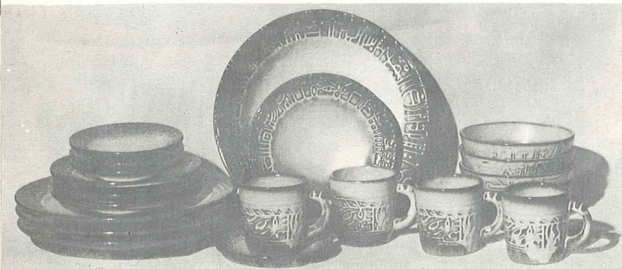
7TS—20 PIECE TERRACE SET, BOXED—19.00