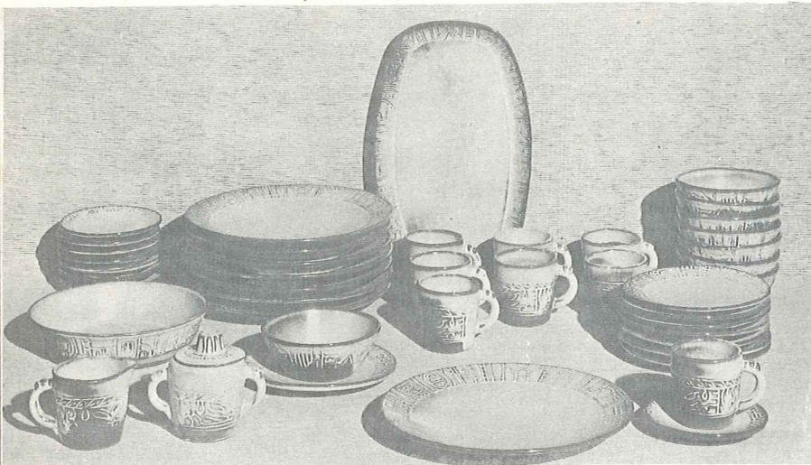
7LS—45 PC. SERVICE SET, BOXED—44.00